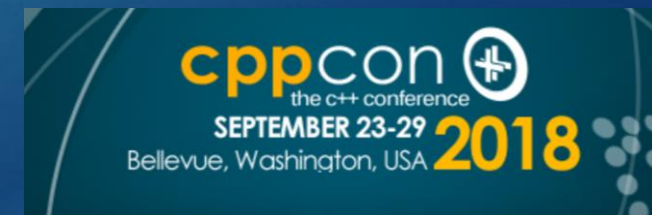
Bellevue, Washington, USA