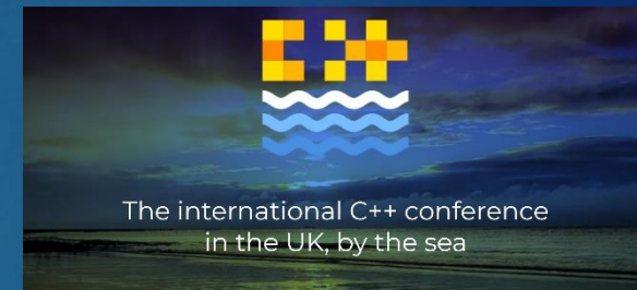
Folkestone, Kent, UK